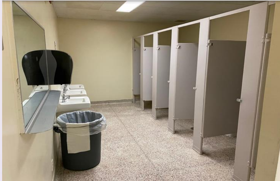
Women's Restrooms – After