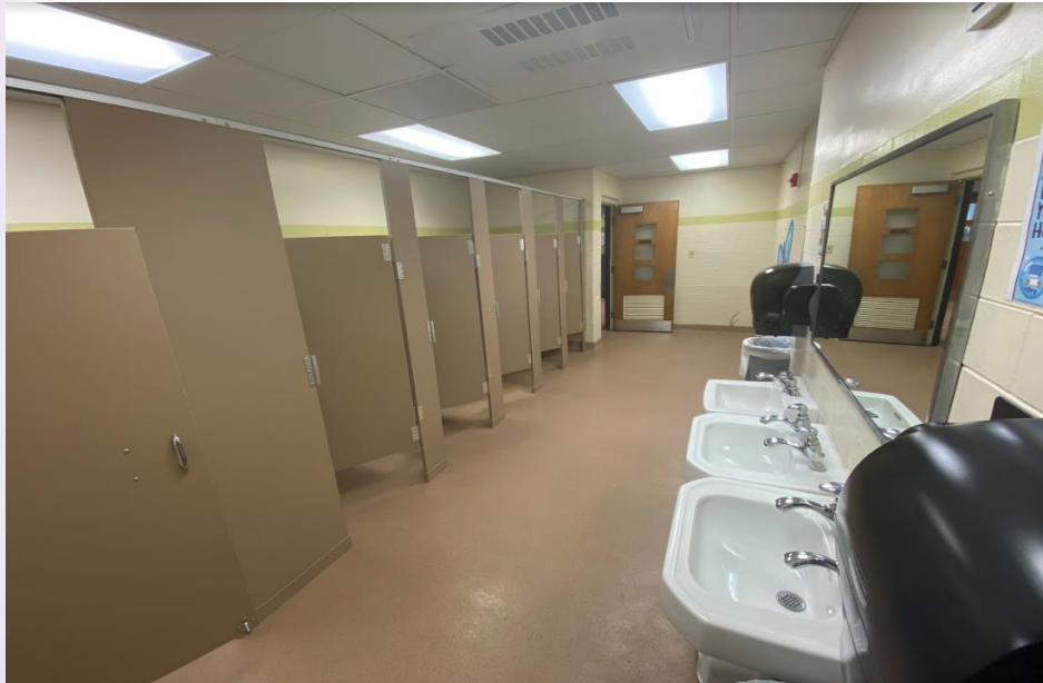
Girl's Restroom - Before