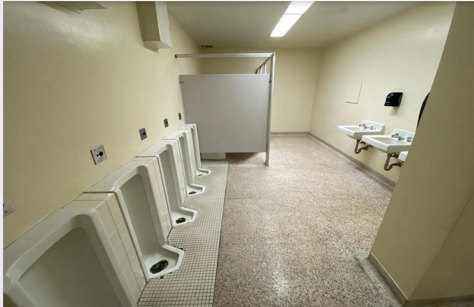
Men's Restrooms - Before