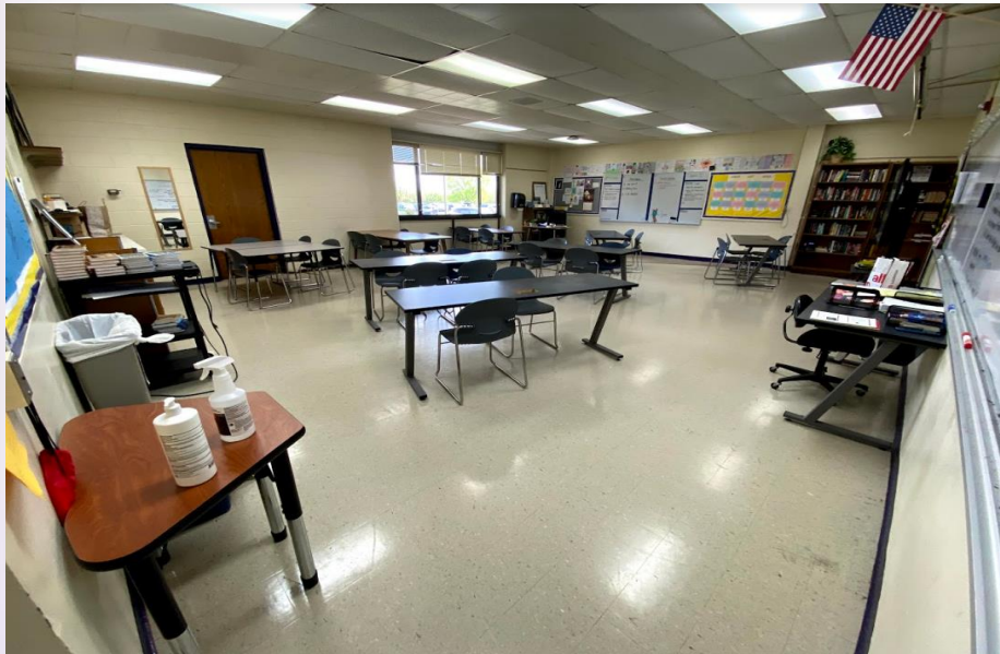
Room 155 – Before