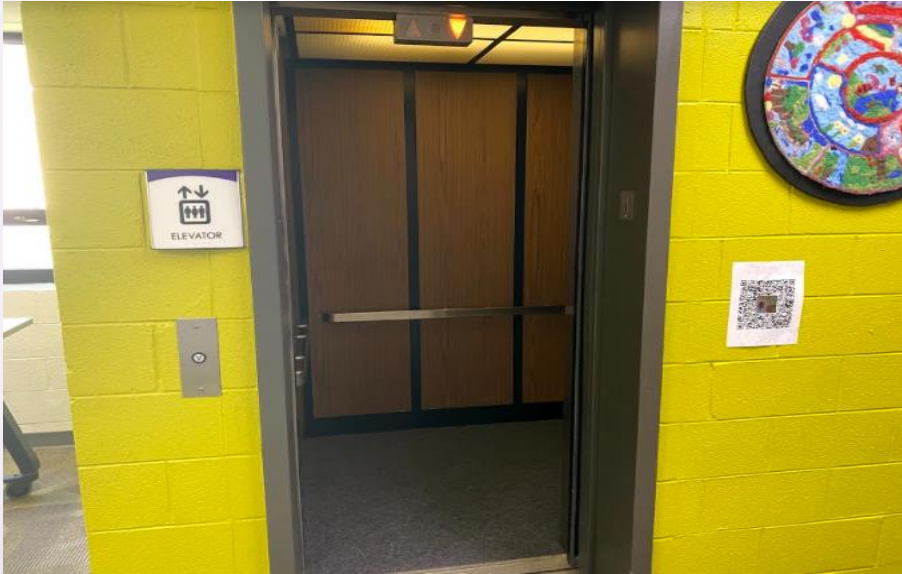
Elevator Car Interior After