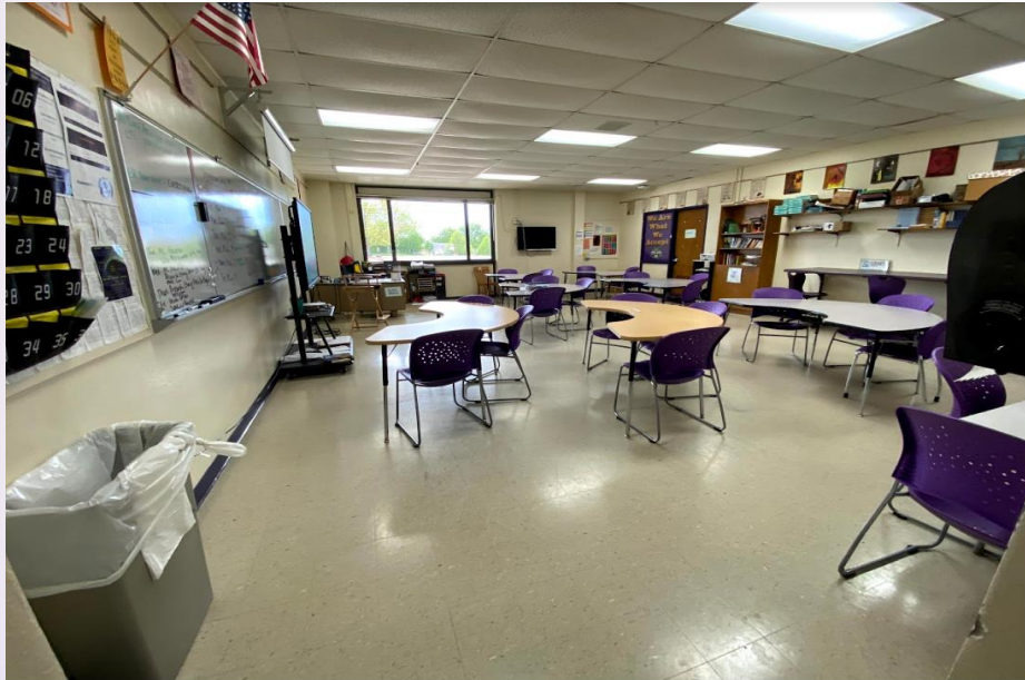
Room 160 - Before