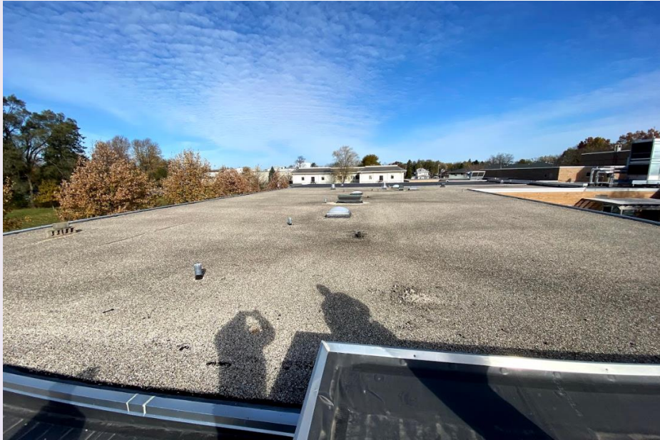
Section 6 - Before