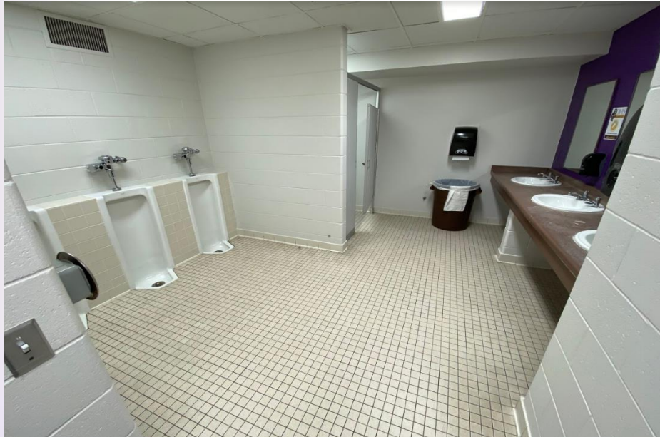
Men's Restrooms - Before