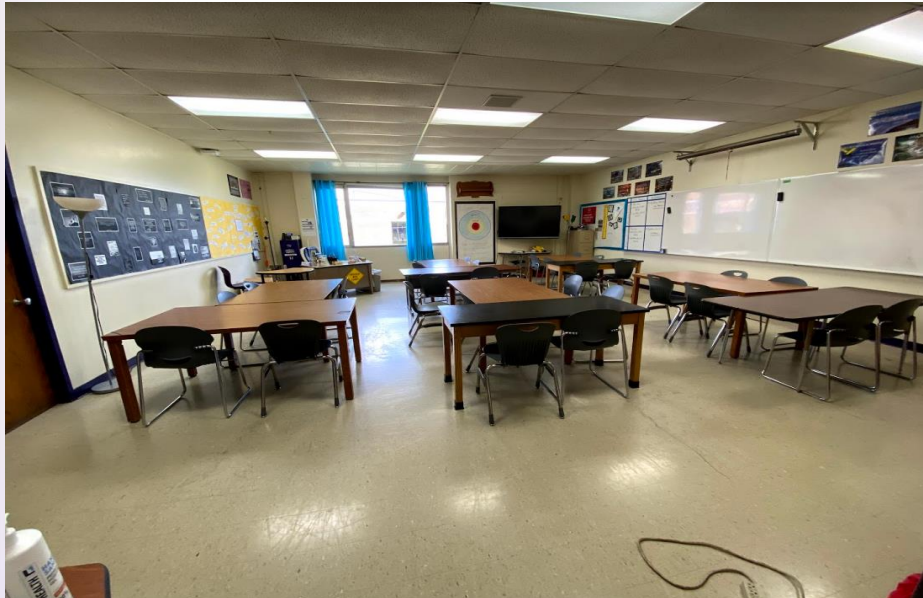
Rooms 154 - Before