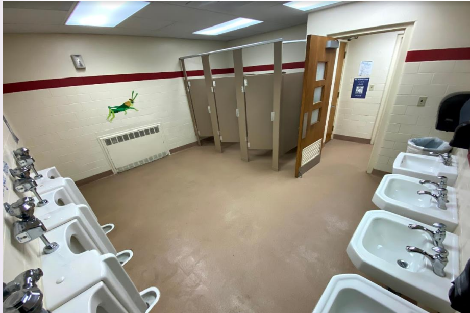
Boy's Restroom - Before