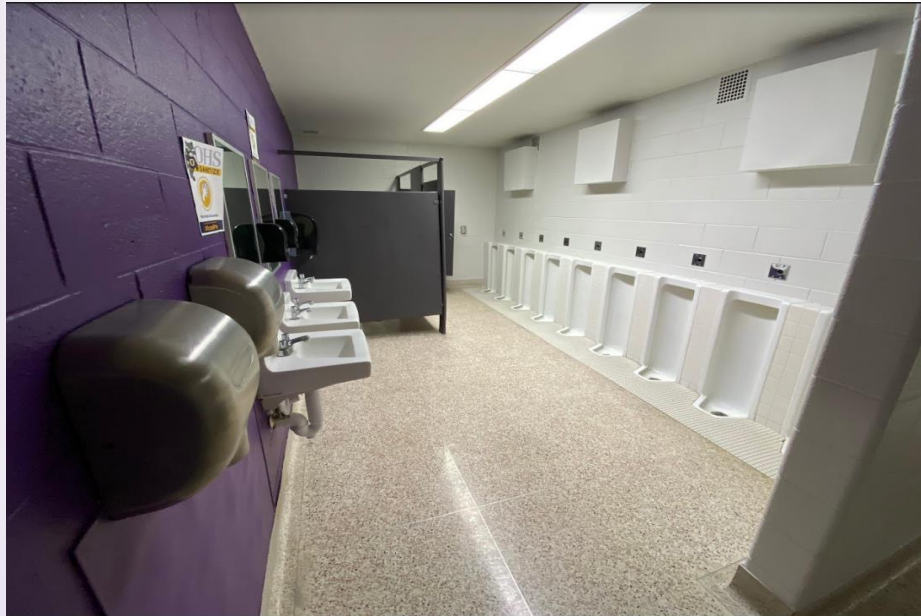
Men's Restroom - Before