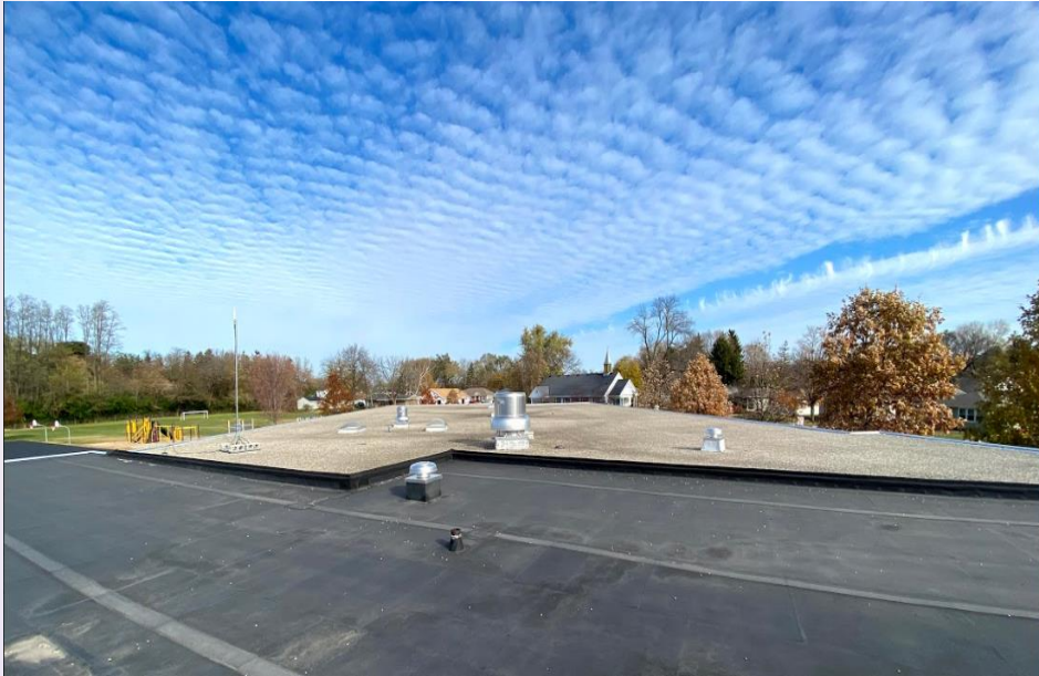
Section 5 – After