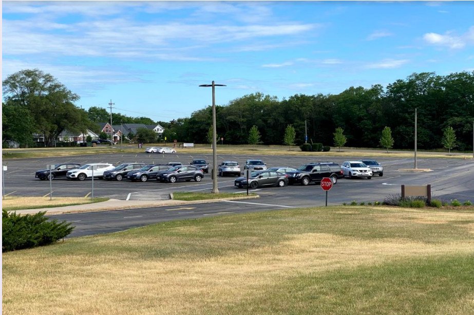
OHS North Parking Lot - Before