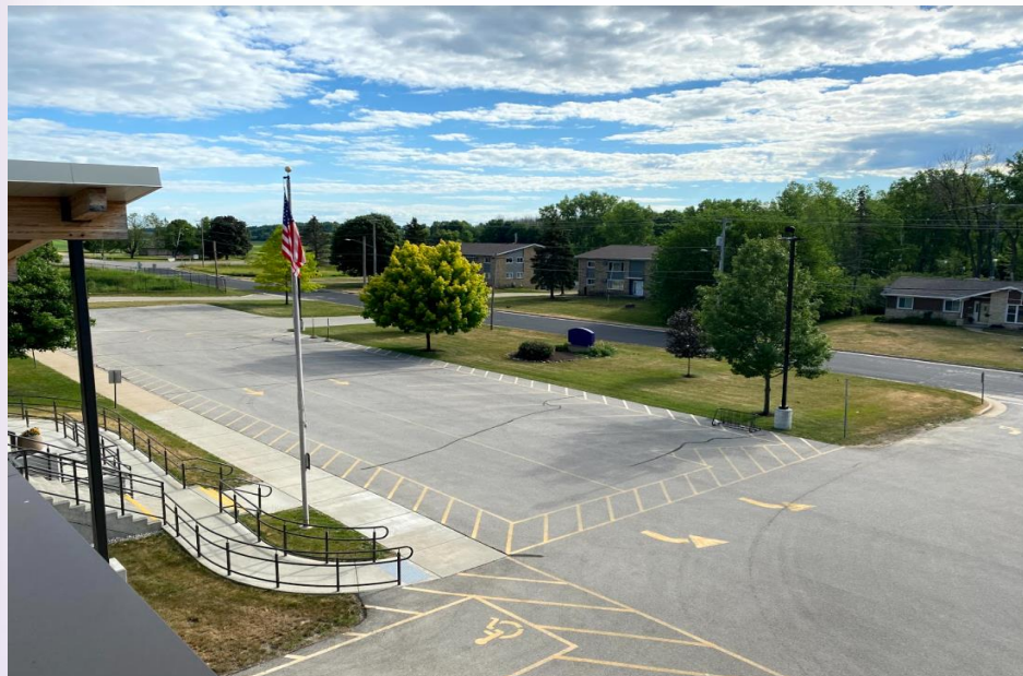
Ixonia Parking Lot - Before