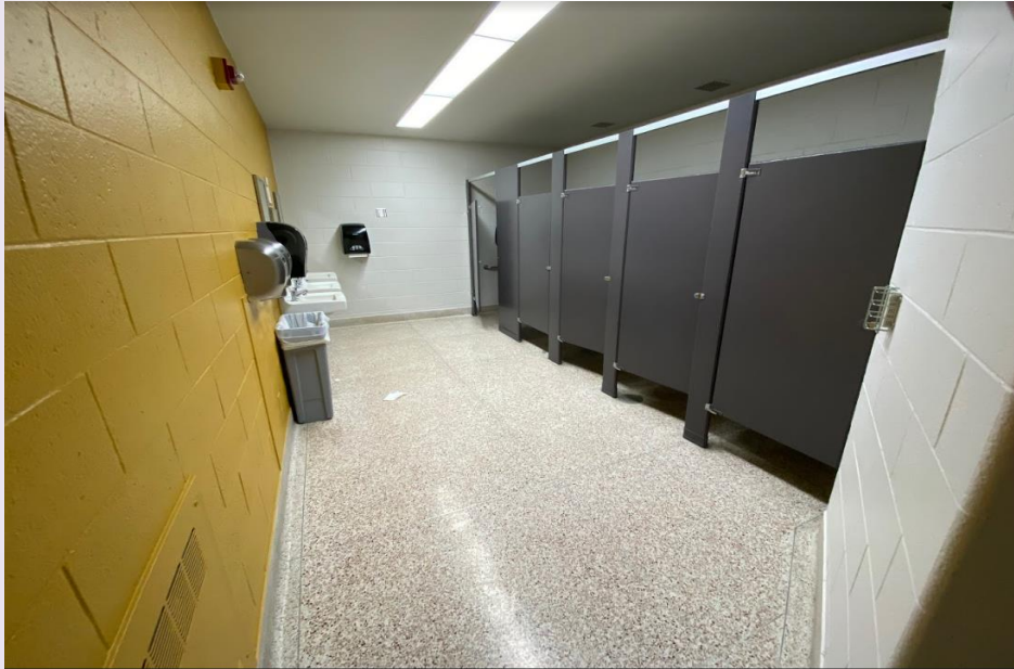
Women's Restroom - Before