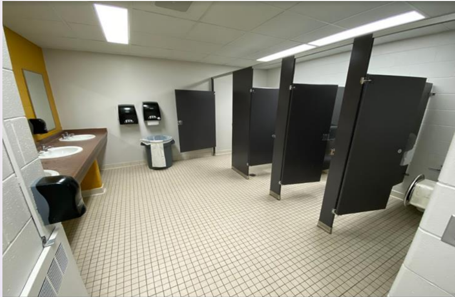
Women's Restrooms – After