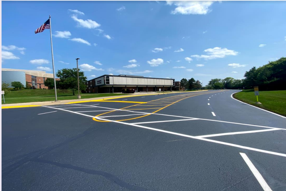
OHS South Parking Lot – After