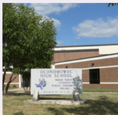
Oconomowoc High School Grades 9-12 641 E. Forest St. Oconomowoc, WI 53066 262-560-3100