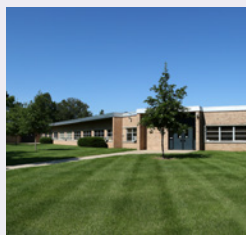
Greenland Elementary Grades 4K-4th 440 Coolidge St. Oconomowoc, WI 53066 262-560-8100

Our district has five 4K-4 elementary schools, two 5-8 intermediate schools and one 9-12 high school. The Oconomowoc Area School District reaches into 13 municipalities in Jefferson, Dodge and Waukesha Counties over 120 square miles. Oconomowoc High School offers both Advanced Placement (AP) and International Baccalaureate (IB) courses, in addition to Project Lead the Way (PLTW), more than 50 clubs and activities, and 27 boys and girls athletic teams.