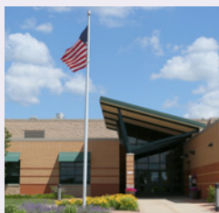
Summit Elementary Grades 4K-4th 1680 Valley Rd. Oconomowoc, WI 53066 262-560-8300