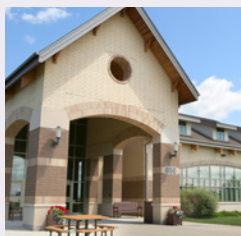
Nature Hill Intermediate Grades 5-8 850 Lake Dr. Oconomowoc, WI 53066 262-569-4940