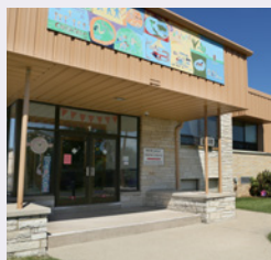
Ixonia Elementary Grades 4K-4th N8425 North Rd. Ixonia, WI 53036 262-560-8400