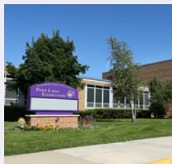
Park Lawn Elementary Grades 4K-4th 300 Park Lawn St. Oconomowoc WI 53066 262-560-8200