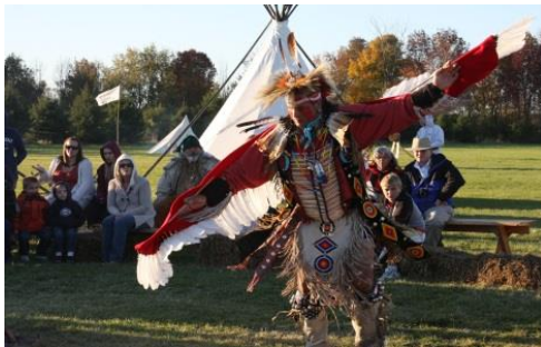
Buffalo Big Mountain

Period & Native Traders, Horse Drawn Carriage Rides, Black Smith, Flint Knapper, Face Painting, Trapper, Cannons, Indian Artifact Display, Period Food, (Fry Bread, Buffalo Burgers, Timberline Chili, Mountain Man BBQ, Kettle Korn), and Many Other Events on Going All 3 Days