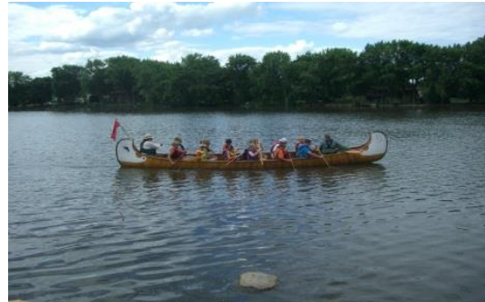
28' Northwest Fur Company Canoe

Ashippun Town Hall 6 miles south of Hwy. 60 6 miles north of Hwy. 16 Corner of Co. Hwy. O & P Ashippun, WI 53003