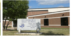
Oconomowoc High School