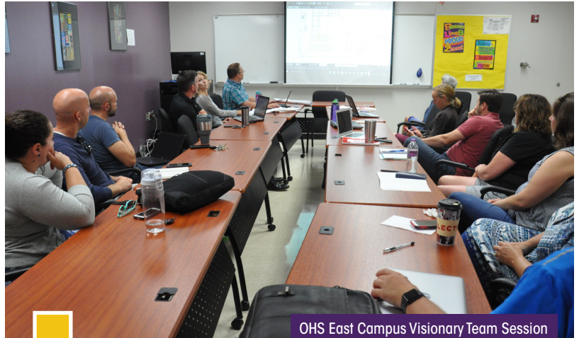
OHS East Campus Visionary Team Session

East Campus is intended to provide flexible classroom space relief for the OHS Main Campus, and will include many of OHS's new Center for Advanced Professional Studies (CAPS) courses. These courses are designed to provide real-world learning opportunities for our students in a project-based environment.