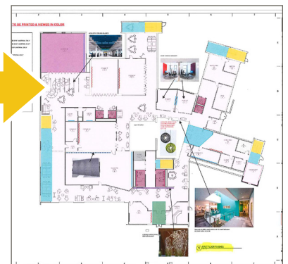
OHS East Campus Schematic Floor Plan