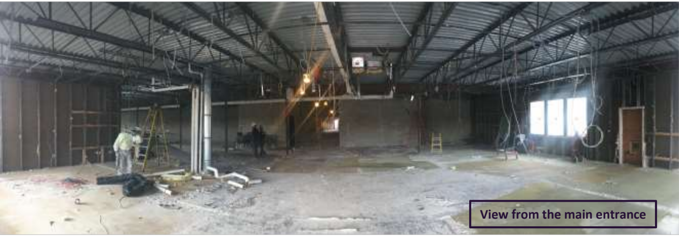
View from the main entrance

Interior demolition and asbestos abatement at OHS East Campus is 95% complete, making the site ready for the public bidding phase to begin this month. Scheduling interior demolition and abatement prior to public bidding has generated higher interest from contractors planning to bid on the project because the site is open, abated, and ready for work to begin. Construction will begin in earnest after bidding and be completed in time for the 2018-19 school year.